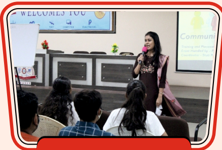
Communication Skills 1 st July, 2021