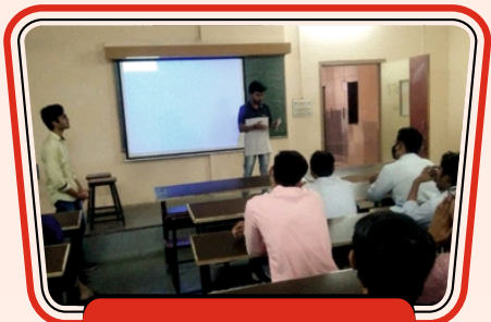
Company Hunt 30 th Sept, 2021