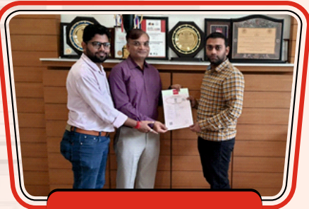
MOU with Bigscal 23 rd Aug, 2021