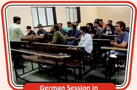
German Session in Mechanical Engineering by Smart German 7 th Sept, 2021