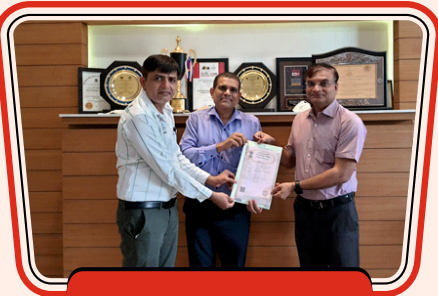
MOU with National group 23 rd March, 2022