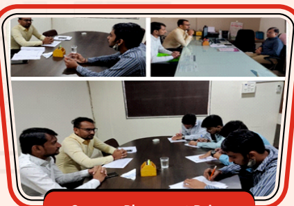
Campus Placement Drive of Rentech Digital on 22 nd March, 2022