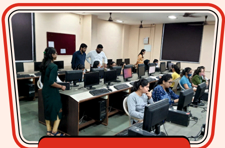
Aptitude Test 9 th Sept, 2021