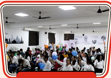
Team Building Workshop 4 th Sept, 2021