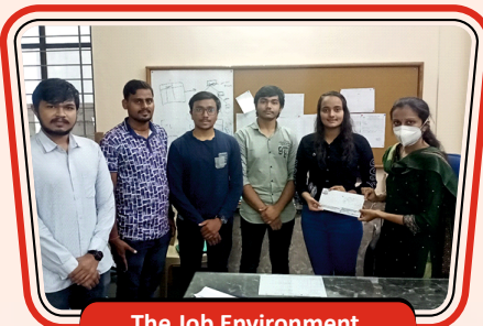
The Job Environment And The Skills Require To Be Excell In Computer Industry 14 th Sept, 2021