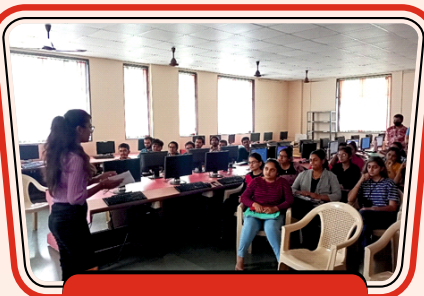
Interview Skills 22 nd Sept, 2021