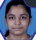
Ghori Srushti (E&C) Sai Impex