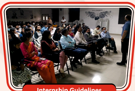
Internship Guidelines & Procedure For Final Year Students 3 rd Jan, 2022