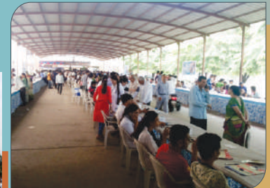
Free Health Check-up