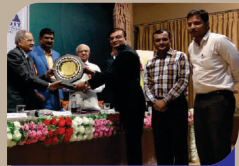
Awarded best Engineering college 2017 by ISTE in 22 nd Annual convention