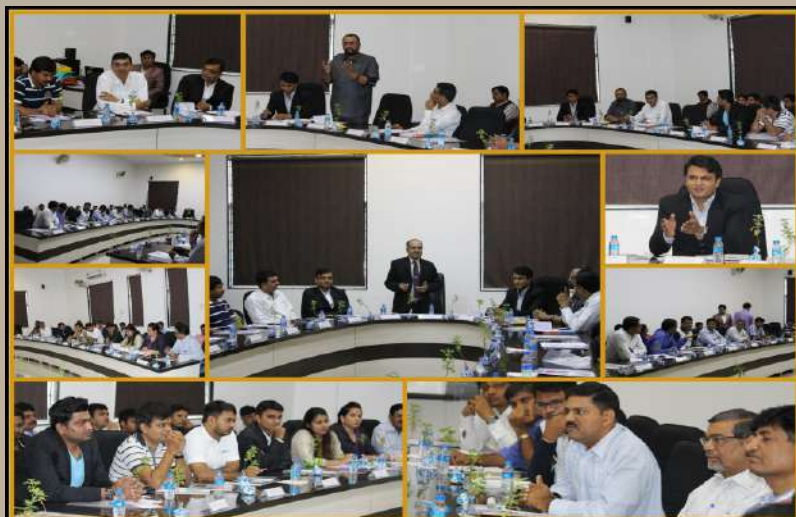
Industry Institute Meet 2016