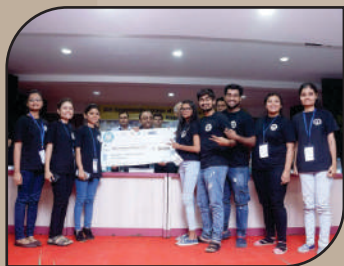
National Level Winner of Hackathon-18 Awarded 50,000/- Cash Prize