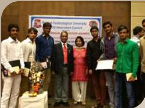
I-Scale award nominated by Vatsalya N.G.O.