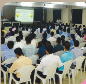
PPT (PRE PLACEMENT TALK)