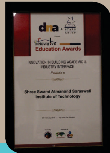
Awarded "Innovation and building Academic and Institute interface" by DNA & Stars of the industries group - 2016