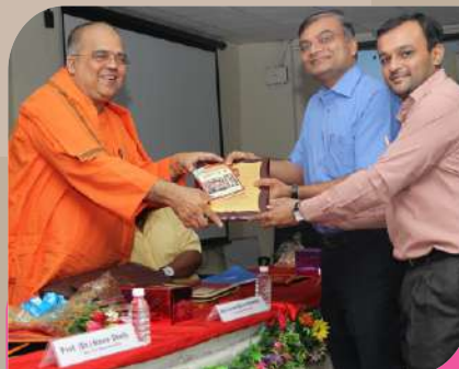
Awarded by GTU on National Technology day for pedagogical innovation