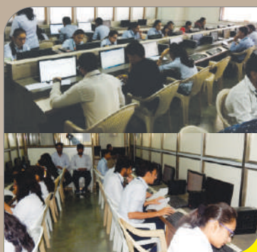
ONLINE/OFFLINE WRITTEN TEST