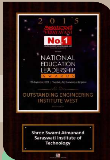
National Education Leadership Award by Vijaywani-2015