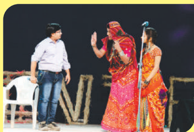
VIVIR - The Cultural Event