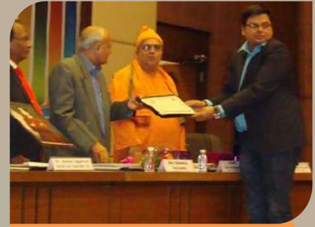
Awarded for O.S.T. Club