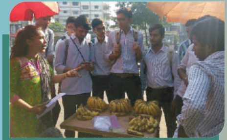
Vittiya Saksharta Abhiyan - VISA