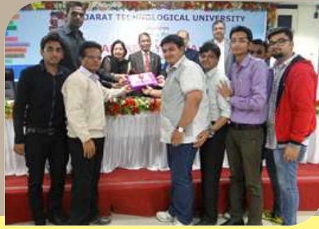
Received award for best performance in Vishwakarma Yojna